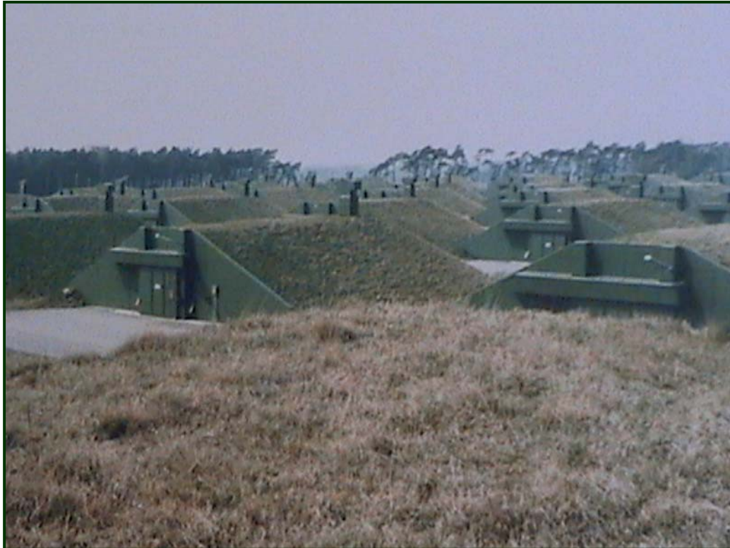
Photographs 1 and 2 Ammunition Bunkers located in the state of North Rhine Westfalia near the town of Kevelaer